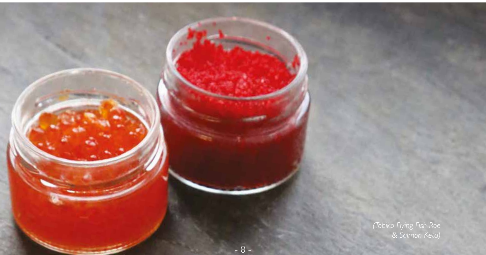
(Tobiko Flying Fish Roe & Salmon Keta)